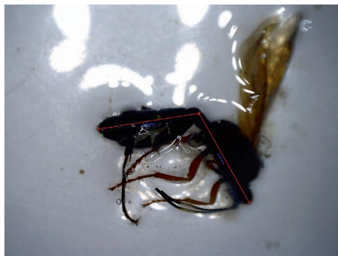
Figure 3. Example of prey item measurement.

"full", when at least one prey item was recognizable. For each full stomach content the minimum number of recognizable items was counted according to (ref. 5). For each typology of prey item, we counted the prey items as the sum of a ) whole prey, b ) heads, c ) residual of single abdomens and single heads (only when abdomens > heads). Considering that stomach contents often contained numerous prey segments, when single appendices were recognisable with confidence (e.g., pincers, elytra), and no head/abdomen were matching with them, we added to the previous count the half (rounded up) of the appendices sum. Using a digital microscope (MAOZUA 5MP 20×–300×) we took pictures of the intact prey items and measured the maximum length (mm) using a built-in software (Fig. 3).