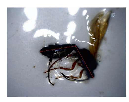
Figure 3. Example of prey item measurement.

Figure 2. Stomach flushing and details of vertebrate prey items. (a) Hydromantes underwent stomach flushing; (b) Hydromantes ' skin found in the stomach contents (detail); (c) two Hydromantes eggs found in the stomach of a female of H. imperialis ; (d) dorsal view of a juvenile Hydromantes eaten by a H. ambrosii female (bar = 1 mm).