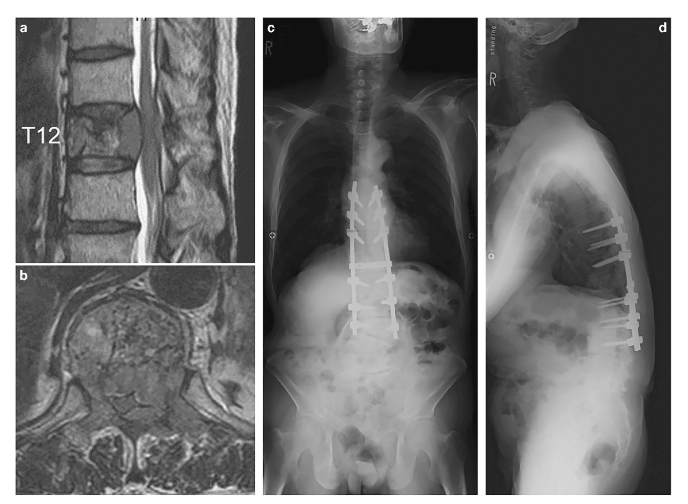
Figure 3 A 71-year-old male with prostate cancer. (a) Preoperative magnetic resonance imaging (MRI, T2-weighted sagittal view) demonstrates a pathological fracture of the T12 vertebral body and spinal cord compression. (b) Preoperative MRI (T2-weighted axial view) shows that the T12 vertebral body, left pedicle and transverse process, and lamina were infiltrated with the tumor, and the epidural mass compressed the spinal cord. (c, d) Postoperative anteroposterior standing X-ray (c) and lateral (d) images at one year after surgery.