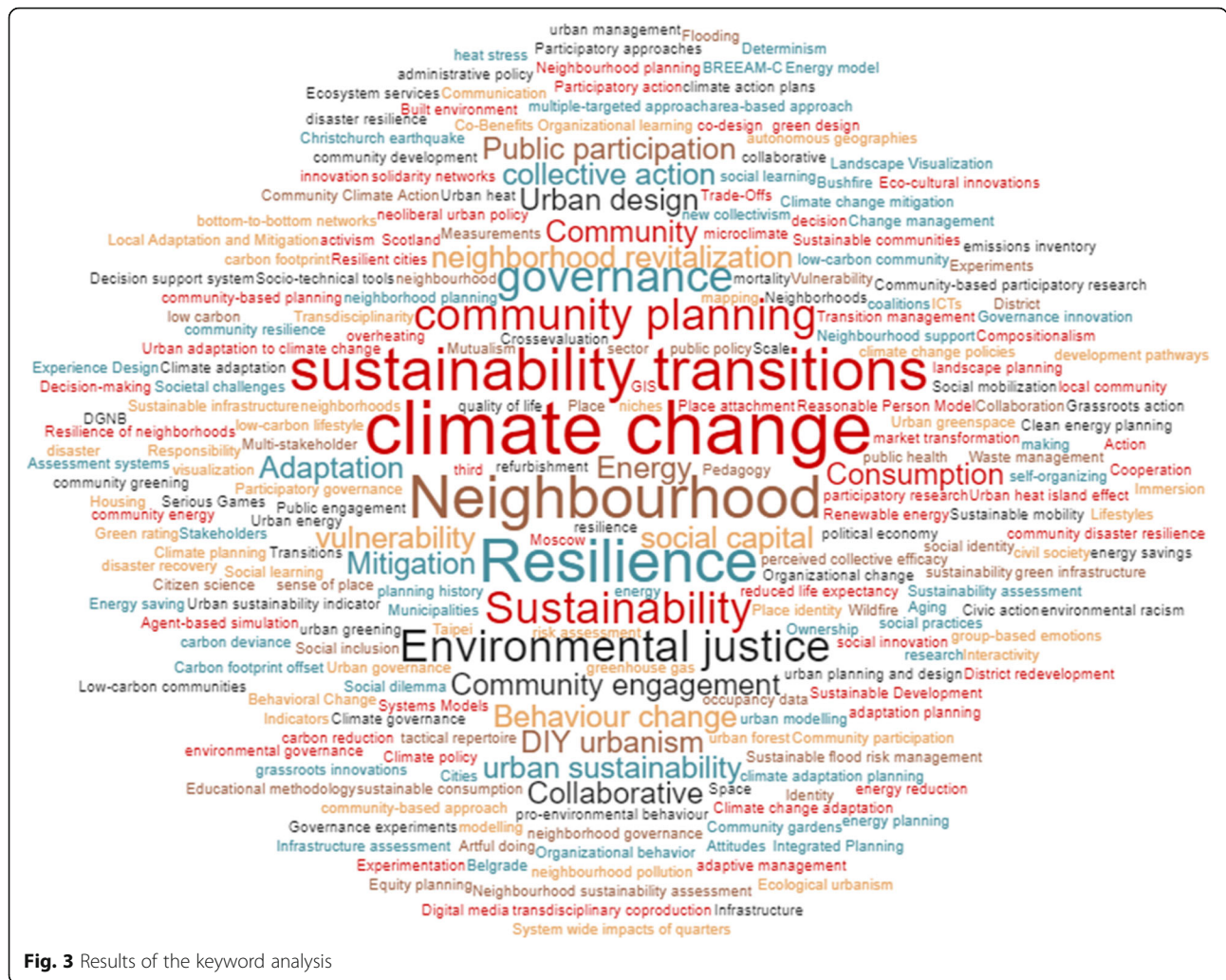
Fig. 3 Results of the keyword analysis

intricate interaction between buildings, transport, green spaces, human activity and structures (Evola et al., 2016).