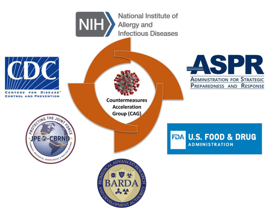
Fig. 2 Merging US government centers of excellence for COVID-19. The Countermeasures Acceleration Group, formerly known as Operation Warp Speed, is a partnership between the Departments of Health and Human Services (HHS) and Defense (DoD) with the mission to accelerate the development, manufacturing, and distribution of COVID-19 vaccines, therapeutics, and diagnostics.

including a vaccine regime with a germline-targeting prime with boost to induce broadly neutralizing antibodies against HIV (NCT05001373). In addition, an ongoing first-in-human study is evaluating whether delivery of soluble or membrane-bound HIV Env trimers via an mRNA platform is a promising platform for rapid and iterative HIV vaccine development (NCT05217641).