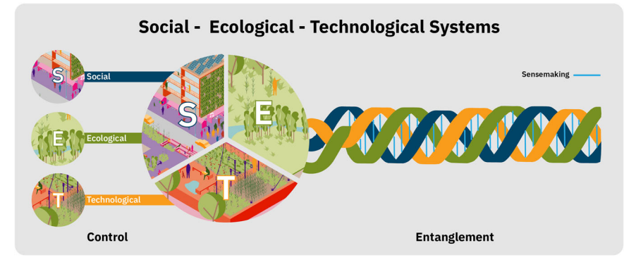
Fig. 2 From control to entangled SETS. Social, ecological, and technological systems can be brought together to improve sensemaking but need to move beyond traditional systems thinking approaches to advising understanding and decision-making within and for entangled SETS. This is represented as a helix of intertwined, dynamic social-ecological, technological systems (SETS) where blue lines are ongoing efforts to make sense of complexity as it evolves and responds to itself and outside drivers and disturbances. SETS helix adapted from<sup>2</sup>.

Novel sensemaking necessitates intentional self-critique and scrutiny over the values, normative dimensions, knowledge, and assumptions about how the world works and how we respond amidst this uncertainty<sup>44,50</sup>. Through sensemaking, institutions can re-imagine and restructure their relationship with SETS, scrutinizing if their values, structures, and functions reflect the entangled social, ecological, and technological domains, thus building towards requisite variety. Even more important, sensemaking requires that governance actors critically question what kinds of urban systems are being co-produced by our institutional goals, designs, and knowledge-generating and management operations<sup>51</sup>. In the following section, we develop several modes that build requisite variety for institutions and facilitate sensemaking in entangled SETS.