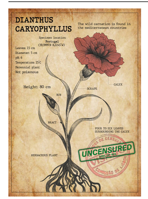
Artistic illustration alluding to the Carnation Revolution that liberated Portugal from the high levels of censorship that had been imposed by a dictator's regime.

In 2024, Portugal celebrates the 50th anniversary of the Carnation Revolution, which brought down a long dictatorship and reinstated elemental civil liberties and democracy in the country. For Portuguese science, this revolution meant a democratisation of access to the scientific career and an increased investment in scientific research, which culminated in an unprecedented rise in scientific output. Communications Biology joins this anniversary and celebrations of freedom and democracy as basic pillars of scientific endeavour.