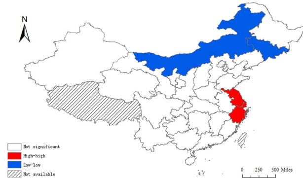
Fig. 3 Local spatial autocorrelation clustering phenomenon of healthcare provider knowledge of palliative care. This shows the aggregation of palliative care knowledge levels among healthcare providers.

The original article has been corrected.