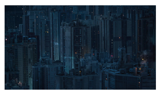
Fig. 7 A screenshot from the Ghost in the Shell live action adaptation. The establishing shot shown before the epilogue lacking the "idols" that have been featured in establishing shots throughout the film (Sanders, 2017). The use of this image adheres to the Fair Use Agreement in Copyright Law.

Killian eventually comes face to face with Kuze, initially viewed upon as a heartless antagonist; but through her conversation with him realizes that there is a deeper connection between the two of them. Kuze, as the Campbellian "shadow presence" throughout