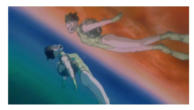
Fig. 3 A screenshot from the Ghost in the Shell anime film. A shot of Motoko Kusanagi looking into the mirror as she rises to the surface of the ocean (Oshii, 1995). The use of this image adheres to the Fair Use Agreement in Copyright Law.

philosophical conversation about the meaning of the self and what makes an individual truly unique in a society where everyone is engrossed with cybernetic enhancements. Furthermore, the cybernetic enhancements they currently wield belong to the government, which makes them properties of the government as well. In the vastness of the digital information network, an individual is but a mere speck in the crowd. Only by looking beyond what is visible to the naked eye and deeply process the information laid forth can one's individual identity shine and give his "ghost" meaning. It is evident that Kusanagi still clings onto logic in order to make sense of the questions floating around in her mind at this point in the anime. She has not fully developed an awareness, and the acceptance, of "the sigh of things" associated with Japanese mythology (Campbell, 2014).