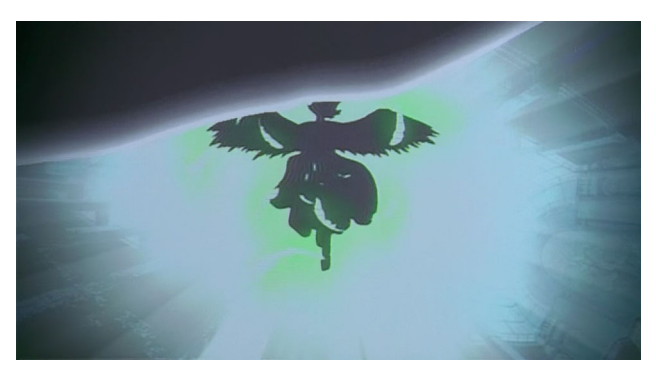
Fig. 4 A screenshot from the Ghost in the Shell anime film. The last image seen by Kusanagi before completely merging with the Puppet Master (Oshii, 1995). The use of this image adheres to the Fair Use Agreement in Copyright Law.

not give rise to variety and originality. Life perpetuates itself through diversity, and this includes the ability to sacrifice itself when necessary. Cells repeat the process of degeneration and regeneration until one day they die, obliterating an entire set of memory and information. Only genes remain. Why continually repeat this cycle simply to survive by avoiding the weaknesses of an unchanging system?"