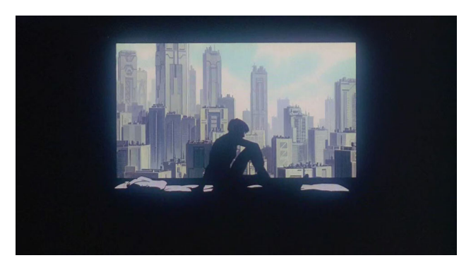
Fig. 1 A screenshot from the Ghost in the Shell anime film. A frame within a frame shot of Motoko Kusanagi "trapped" in her room overlooking the city skyline (Oshii, 1995). The use of this image adheres to the Fair Use Agreement in Copyright Law.

forth is that one should detach from the logic of the world and simply admire or "dance" to the wonders around them.