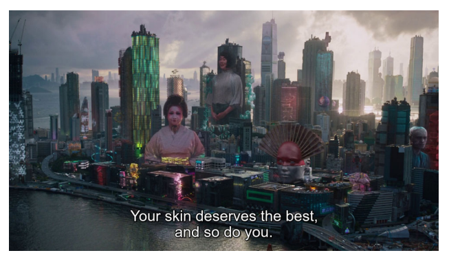
Fig. 5 A screenshot from the Ghost in the Shell live action adaptation. One of the establishing shots in the film showing the "idols" standing amidst the city skyline (Sanders, 2017). The use of this image adheres to the Fair Use Agreement in Copyright Law.

"When I was a child, my speech, feelings, and thinking were all those of a child. Now that I am a man, I have no more use for childish ways. Now I can say these things without help in my own