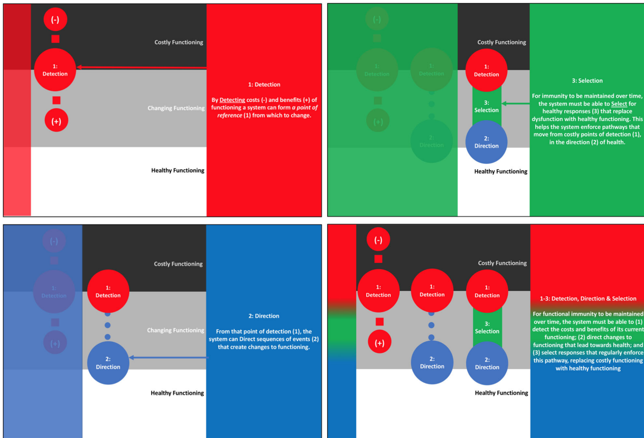
Fig. 2 The path of precision. This model of health demonstrates how precision functions integrate to organize immunity. Functional precision organizes variation. Functional variation can be maintained when functional precision detects, directs and selects for healthy change. When integrated, the precision functions serve health from multiple levels.

biological and behavioral immune systems can be helpful when creating messaging about population health. The tangible parallels among biological and behavioral immune systems can be helpful when tailoring intervention-messages to populations. For example, not all in the population can immediately understand the function of immune receptors. However, more in the population will be ready to understand how interventions support their ability detect the pros and cons, the costs and benefits, of changes in health. When creating messages about the important steps towards population immunity, researchers can use the logic to explain interventions: