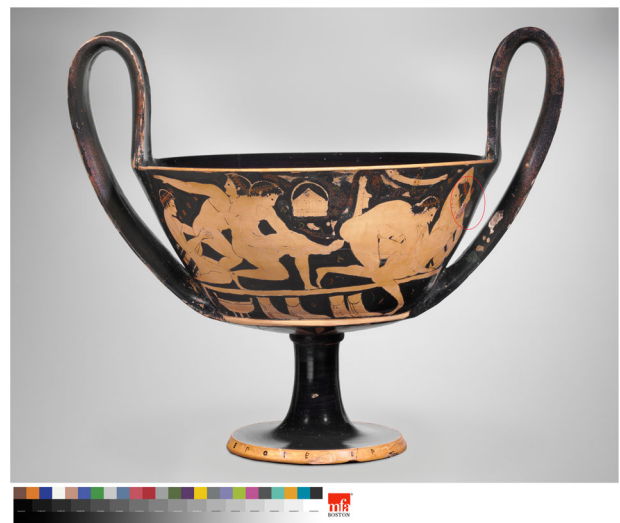
Fig. 4 Attic red-figure kantharos attributed to the Nikosthenes painter, 520–510 BCE. Boston (MA), Museum of Fine Arts, 95.61.

The second example for this category is a cup attributed to the Pedieus painter dating to ca. 510 BCE (Fig. 5), today in the Louvre. 28 Here we see a woman lying on a stool, her stomach down, performing fellatio and being penetrated simultaneously. The penetrating bearded man raises a sandal and is about to strike her. To the right, another woman is seen crouching on a cushion, also performing fellatio on a man. Another man standing behind her has one hand placed upon her back and the second raised; but unfortunately, since the part of the vase