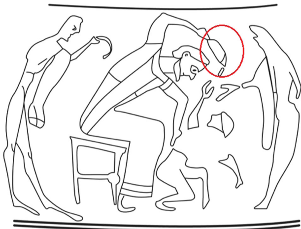
Fig. 2 Attic black-figure amphora attributed to the painter of Würzburg 252, ca. 540 BCE. Adolphseck, Schloss Fasanerie, 130. Illustration: Nurit Young.