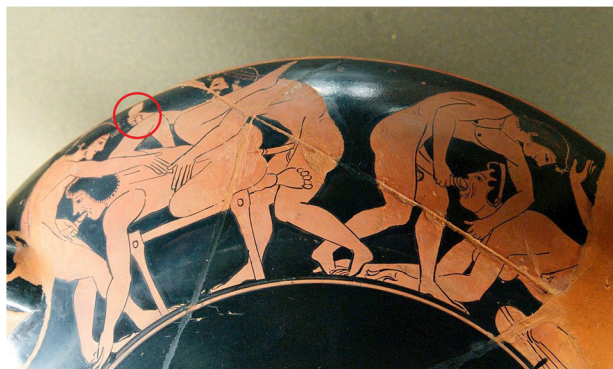
Fig. 5 Attic red-figure cup attributed to the Pedieus painter, ca. 510 BCE. Paris, Musée du Louvre, G13. This file is licensed under the Creative Commons Attribution 3.0 Unported license. Reproduced with permission Marie-Lan Nguyen; copyright © Marie-Lan Nguyen, all rights reserved.