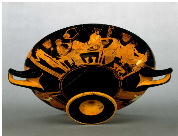
Fig. 8 Attic red-figure cup attributed to the Brygos painter, 490–480 BCE. London, British Museum, E68. This file is licensed under the Creative Commons Attribution-Non Commercial-Share Alike 4.0 International (CC BY-NC-SA 4.0) license. Reproduced with permission of the British museum © The Trustees of the British Museum, all rights reserved.

other objects, was the painters' choice for depiction in violent, seemingly non-normative usage in this context.