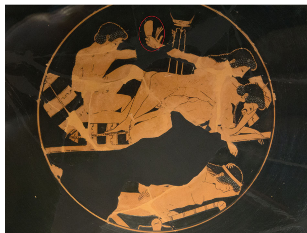
Fig. 7 Attic red-figure cup attributed to the Thalia painter, ca. 500 BCE. Berlin, Antikensammlung, 3251. This file is licensed under the Creative Commons Attribution-Share Alike 4.0 International. Reproduced with permission Zde; copyright © Zde, all rights reserved.

The final example is an Attic cup attributed to the Thalia painter and housed in Berlin, dating to ca. 500 BCE. 32 At the extreme right end of one of the group sex scenes, a bearded man with a prominent erection is shown grasping the upper right arm of a naked woman who walks to the right while turning her head leftwards, towards the man. In her left hand she holds an empty cup. In the background, behind the man, stands a lamp stand with suspending ladles, and there we see what is most likely the tip of a sandal held by the man. We can presume he is threatening the woman with this object. Importantly, the scene that decorates the tondo represents the only case in category (c), namely heterosexual sex with the sandal wielded by the female (Fig. 7). It constitutes a reversal of the usual situation: in the course of sexual intercourse taking place in the symposium, a woman hits a man with a sandal. The scene depicts a man and woman lying on a kline in a complex position, with the man about to penetrate the woman. She is holding a sandal in her right hand, about to spank the man. Another woman below them, as well as a youth sitting with his left leg raised next to the kline, are masturbating. However, we cannot and should not take this as proof that the vase painters wished to make a statement about women using the sandal to hit. On the contrary, this lone case of role reversal seems