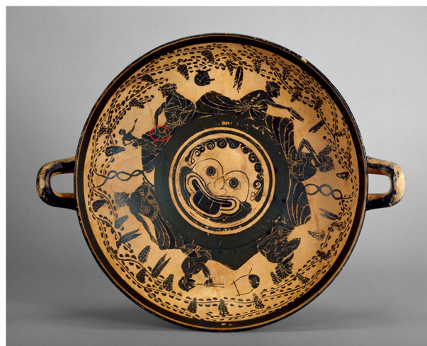
Fig. 3 Attic black-figure pottery stemmed cup attributed to the manner of the Lysippides painter, ca. 520 BCE. Oxford, Ashmolean Museum, AN1974.344. This figure is not covered by the Creative Commons Attribution 4.0 International License.

In several depictions, such educational scenes take place in erotically charged spaces—the gymnasium and the symposium. On a cup attributed to Onesimos and housed in Munich we see