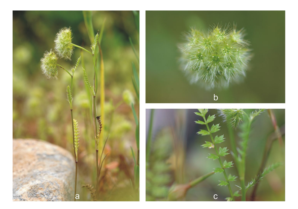
Figure 3. L. cuminoides. Habit ( a ), flowers ( b ), and leaf ( c ) at Statte (Taranto), 13 May 2023.

Plant samples collected during botanical surveys were air dried at room temperature and in the dark. All aerial parts were used (leaves, stem and flowers). The drying phase was considered accomplished when a constant weight was reached. After the drying phase, the plant material was grinded using a coffee grinder for 15 s. The obtained powder was weighted in amber glass bottles and added of hot water or hydroalcoholic solution using