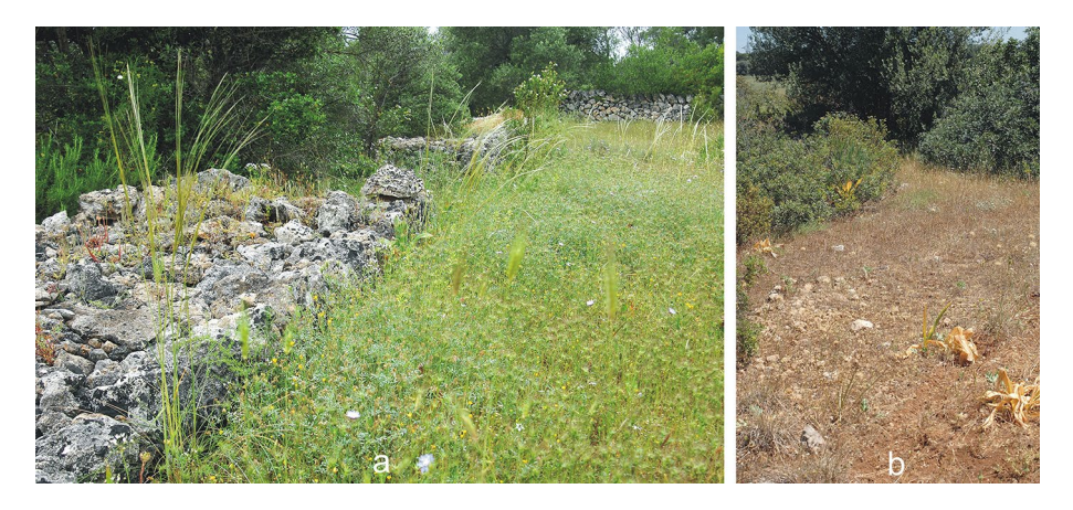
Figure 5. Plant communities on survey days. Pineta di San Giovanni (PSG) with L. cuminoides in bloom ( a ) (15 May 2023) and Gravina di Mazzaracchio (GM) ( b ) (20 May 2022).

In our knowledge, only two papers discuss about the volatiles organic compounds of L. cuminoides . Bahmanzadagan et al.<sup>73</sup> investigated the volatiles of L. cuminoides found in the south of Iran by hydrodistillation and head space analysis. These authors identified 35 volatiles, and among these, thymol, \gamma -terpinene and p-cymene were the most abundant. Baser and Tümen<sup>28</sup> reported the volatiles composition of L. cuminoides collected in three different areas of Turkey and extracted by hydrodistillation. Also, these authors found thymol, \gamma -terpinene and p-cymene as the most abundant compounds. Apart from the differences in the percentages, probably related to the different techniques of extraction, both paper results are in agreement with the results of the present paper, highlighting a common biochemical pathway.