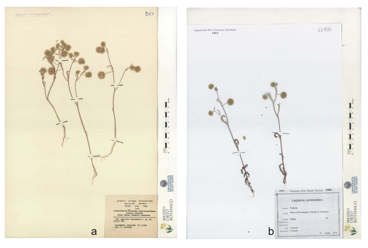
Figure 1. Herbarium samples: (a) Jerusalem (Palestine) (BI 25616); (b) Statte (Taranto-Italy) (BI 43986).

in France, Germany and Norway<sup>17</sup>. In Italy it was probably cultivated since the eighteenth century<sup>18, 19</sup>, for sure growing wild in southern Italy<sup>20–22</sup>, where it was discovered in Apulia, in the province of Taranto at Leucaspide, by D. Profeta, who described its small fruits and its cumin like taste<sup>23</sup>, and confirmed for the same region by other botanists<sup>22, 24</sup>, but after 1912 nobody else recorded it neither in Leucaspide nor in other places of Apulia.