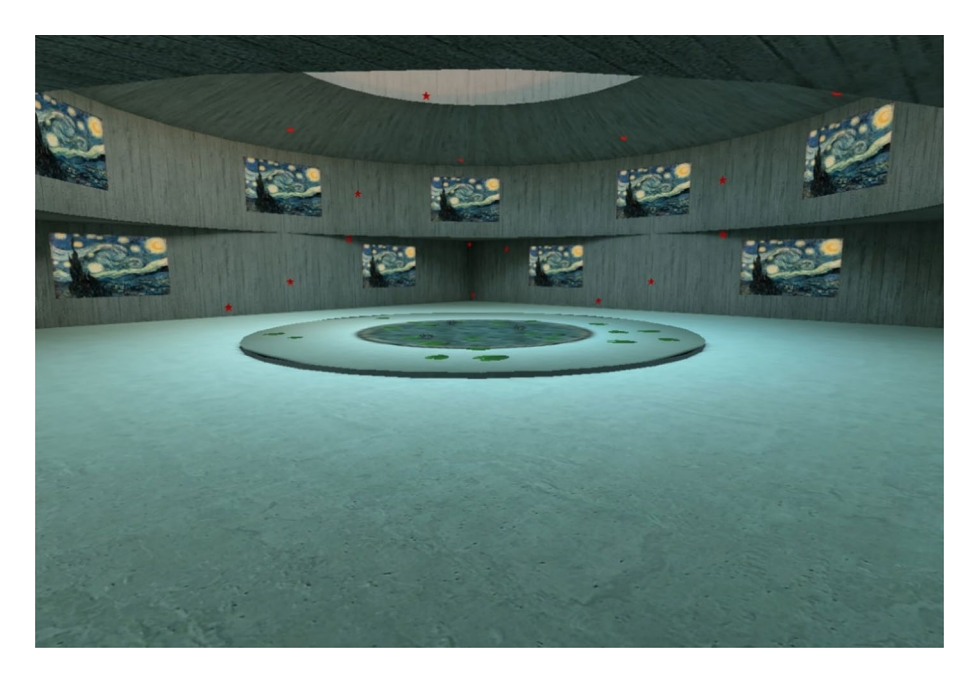
Figure 1. View of the main model presentation and object distribution across the walls and ceiling. Note that canvas textures are included on the figure to represent its position and size dimensions within the gallery.

Sixteen canvas models of 116.05 m \times 72.84 m \times 0.81 m were harmoniously spread on the walls of the gallery. These canvas models were used to display the logotypes. Moreover, 40 red stars of 12.52 m \times 11.91 m \times 1.78 m were randomly distributed over the different walls and ceilings. All model editions were made with Blender<sup>42</sup>. Finally, to improve participants' immersive Ness in the virtual reality environment, an HDRi background and lighting were included.