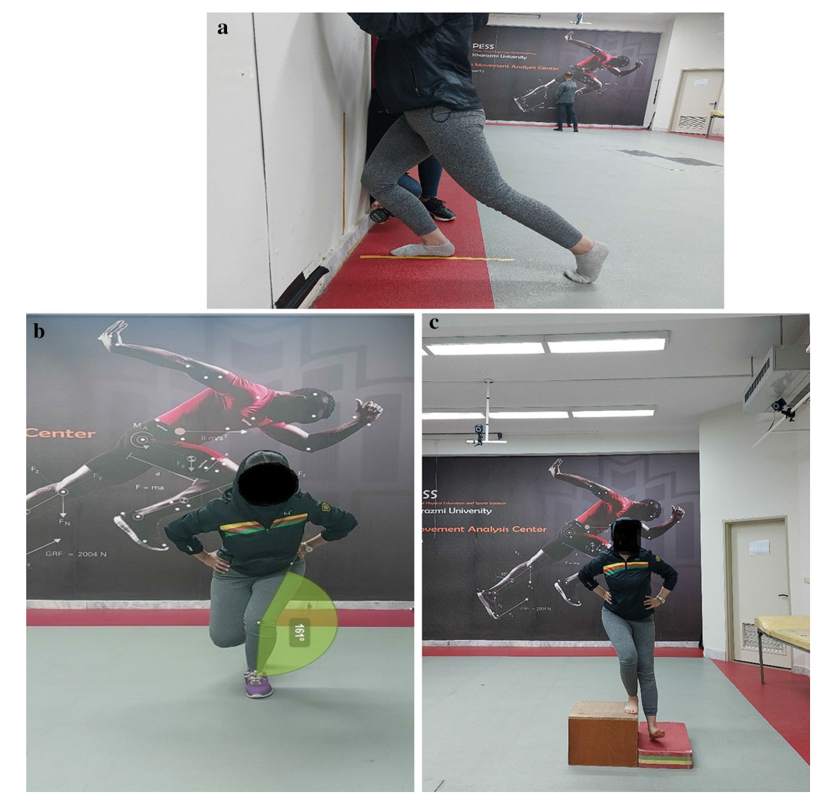
Figure 1. (a) Weight-bearing lunge test ankle dorsiflexion ROM. (b) Dynamic Knee Valgus (DKV) angle measurement. (c) Lateral step-down test (LSD).

Dynamic knee valgus (DKV) angle measurement. We measured the DKV angle during a single-leg squat. The single-leg squat was chosen because it allows for easy visualization of poor neuromuscular control (e.g. increased DKV angle) in patients with PFP and CAI^{7,8} . Participants were asked to stand on the test limb, facing the video camera and then to squat down at an angle of at least 45° knee flexion but not greater than 60°, for 5 s. The knee