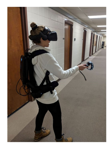
Figure 1. One of the authors wearing VR HMD and backpack computer.