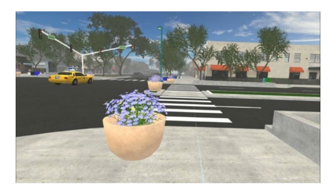
Figure 3. Example scene from modifiable VR environment used in pilot research.