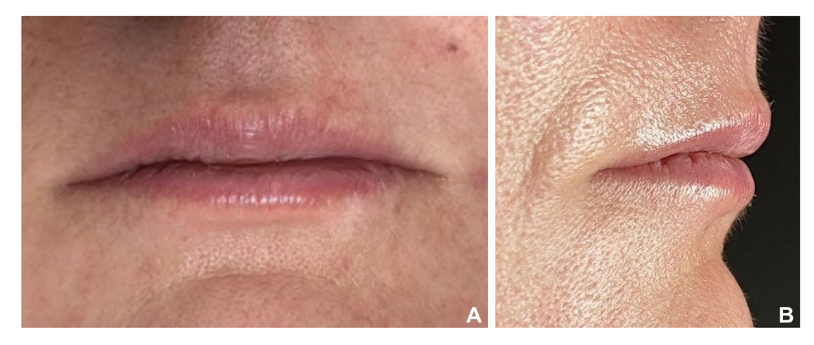
Figure 1. ( A , B ): Patient from Group 1 (Thinner lips) before filling procedure. ( A ) Frontal view; ( B ) Lateral view.

Each site of injection was cleaned with alcohol previous to the procedure. The anesthesia was obtained with topical anesthetic. The microcannula's caliber and extent were 30G and 25 mm, respectively (Magic Needles*, Needle Concept, Paris, France). After the insertion of the microcannula the filler (Rennova Fill*) was injected in a linear retrograde fashion<sup>23</sup>. The filling sites were: the body of the lips, with injection at the wet-dry line, to preserve the natural lip protuberance and to project the body of the lips; oral commissures with injection at the lateral aspect of the lower lip to uplift and support and vermillion border and Cupid's bow, with injection along the vermillion-cutaneous junction<sup>24,25</sup>. As an additional aid to the filling material not going through the midline of the lower lips, a tightly pressed dental floss was used, dividing the lip into 2 equal parts<sup>25</sup>. In addition to this feature allowing the lip to be massaged right after filling, it also allows for more natural contours in the filled