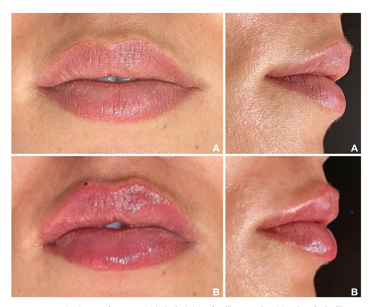
Figure 4. (A,B): Patient from Group 2 (Thicker lips): (A) Before filling procedure. (B) 10 days after lip filling.

Patients with thicker lips at pretreatment showed a significant worsening in the attractiveness score after the filling procedure (Table 3). That is, there seems to be a limit to what is aesthetically acceptable for lip volume. The ideal upper to lower lip vermillion ratio varies from 1:1.6 to 1:2 and is generally described concerning the ideal lips in white women $\frac{8.26}{2}$. Ratios greater than this can be assumed as unattractive. Our results agree with Radwan et al.6. Respondents preferred a more natural lip, considering more full lips unattractive. Our study is essential in the sense that professionals can guide their patients regarding the amount of filler to be injected when the patient already has a specific lip volume at pretreatment. Clinicians must be aware that beauty is an ever-evolving concept subject to trends8. The patient expects his doctor to be up-to-date with the latest scientific literature published in the field and aware of beauty trends. A good talk between the professional and the patient will awaken trust between them.