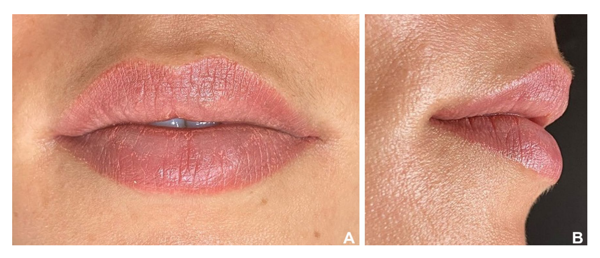
Figure 2. ( A , B ): Patient from Group 2 (Thicker lips) before filling procedure. ( A ) Frontal view; ( B ) Lateral view.

region. The volume injected was 1 ml. All fillings procedures were performed by the same operator (RCGO), at the Dental School Clinic of Inga University Center, in the facial aesthetic courses.