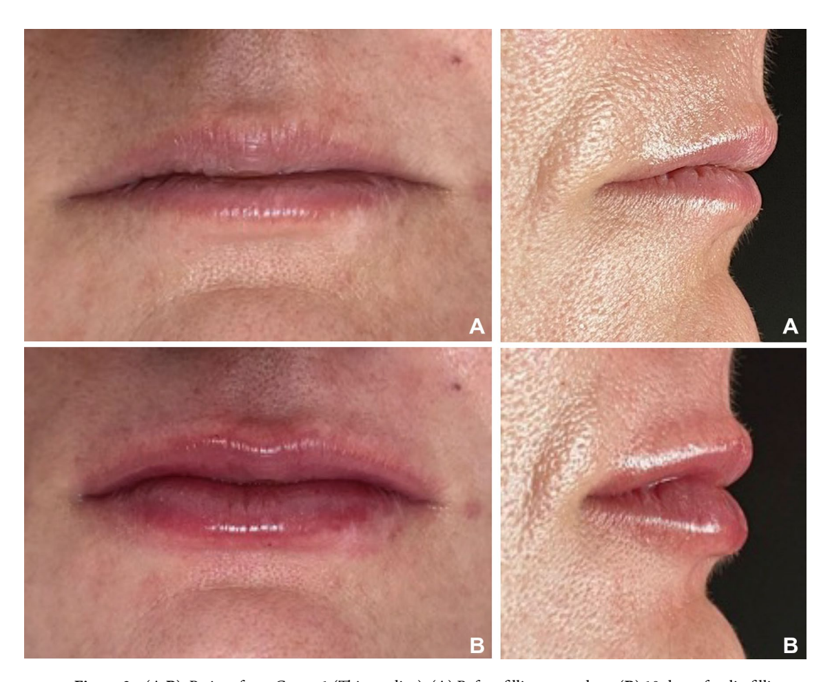
Figure 3. (A,B): Patient from Group 1 (Thinner lips). (A) Before filling procedure. (B) 10 days after lip filling.

facial aesthetics specialists were 39.58 \pm 3.95 , 38.57 \pm 11.32 and 40.17 \pm 9.16 respectively. There were 90, 82 and 51 female evaluators in the layperson, dentists and facial aesthetics specialists groups respectively.