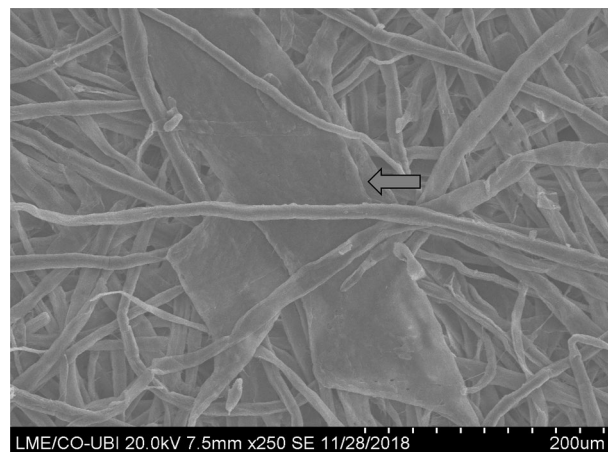
Figure 3. SEM image of a vessel rich sheet surface (the arrow indicates the vessels).