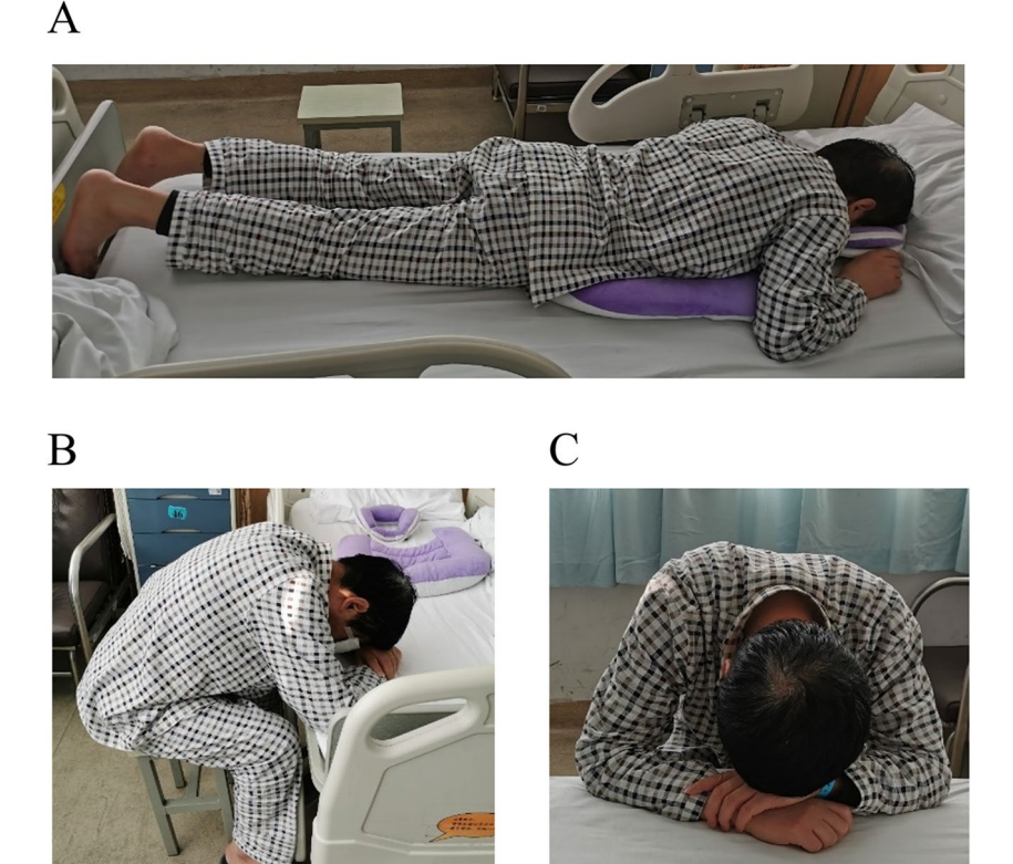
Figure 2. Patient's face down position. ( A ) shows the patient's prone position. ( B , C ) shows the front and side of the patient's sitting posture.

time or unsatisfactory vision improvement, which may trigger doctor-patient contradictions and disputes. The following questions deserve further consideration. What are the challenges that patients face when they are in FDP? What features of medical personnel should assist patients in improving their posture?