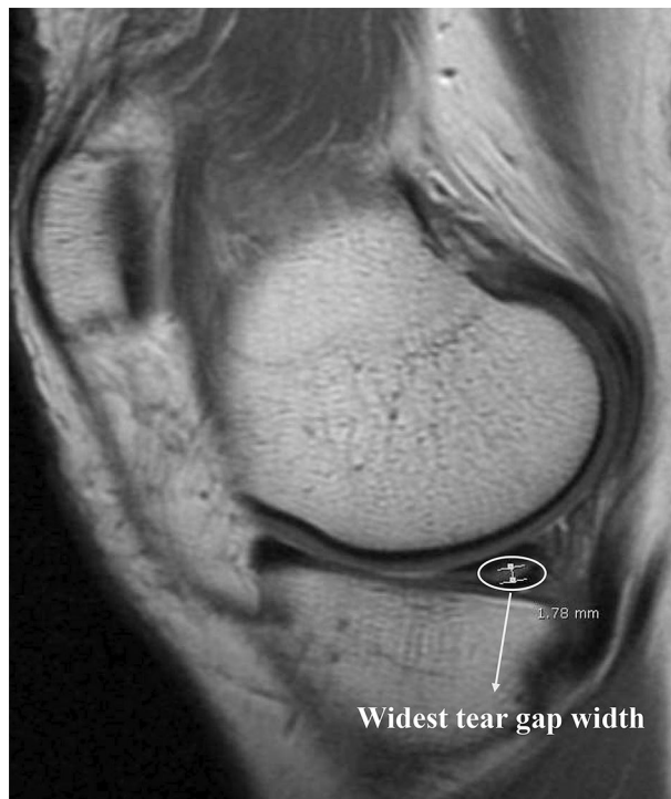
Figure 2. Widest tear gap width measured on the sagittal view of the MRI. Measurements were digitally analyzed via an image analyzing program (Marosis M-view 5.4, Marotech, Seoul, Korea).

medial meniscus only, lateral meniscus only, both menisci), and joint alignment on the standing postero-anterior radiograph (tibiofemoral (TF) angle, divided into 3 groups; varus or less than 1 degree valgus, 1–4 degree valgus, over 4 degrees valgus). All the measurements on the images were digitally analyzed on a picture archiving and communication system via an image analyzing program (Marosis M-view 5.4, Marotech, Seoul, Korea). There was not a single missing data on the factors considered. JLT and mechanical symptoms were the basic physical exams and a standing postero-anterior radiograph was also the basic radiograph that we performed on every patient who visited the outpatient office. The rest of the factors could be confirmed by MRI.