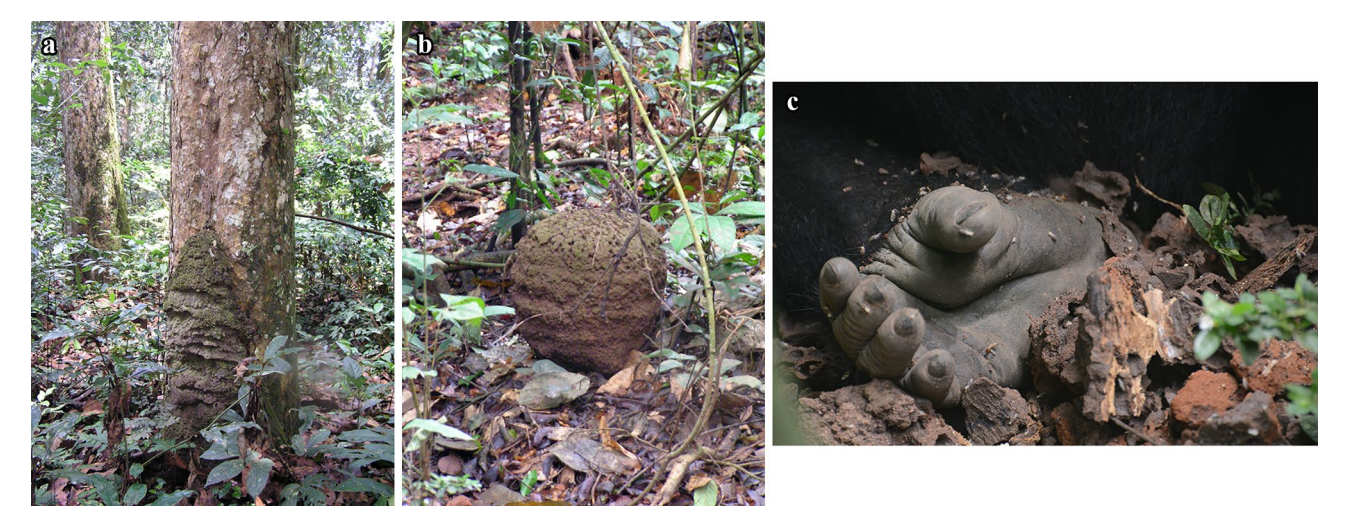
Figure 1. Tree ( a ) and ground ( b ) termite mound of Cubitermes spp. . External surface and cells with larvae of hand-size piece of termite mound of Cubitermes spp. broken by western gorillas ( c ).