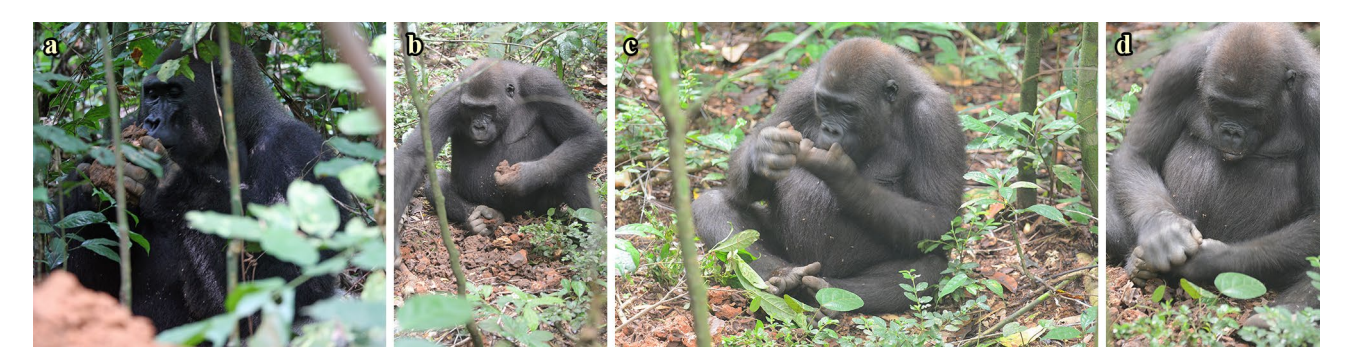
Figure 3. Termite feeding licking technique ( a ). Gorilla picking from the ground a piece of termite mound ( b ), bringing termites to the mouth after pounding ( c ) and bimanually breaking further in half the mound piece.