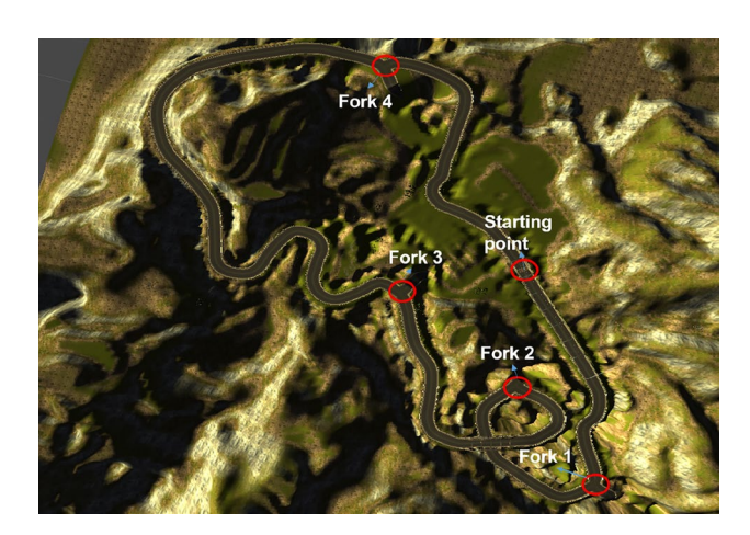
Figure 2. Birds-eye view of driving course with staring point and four crossroads indicated with red circles and blue arrows.

driving experience. In our experiment, we specifically focused on two adult groups between 17 and 24 years (a group that had more speed violations<sup>56,71,72</sup>) contrasted with an older group of 24–31 years of age. Statistical tests and multiple regression models were then used to identify those personal factors that significantly predicted the measured driving speeds. To summarize, the aim of the present study was to employ virtual reality (VR) to investigate whether it is possible to predict the average and maximum driving speed in a rural road environment from different psychological metrics.