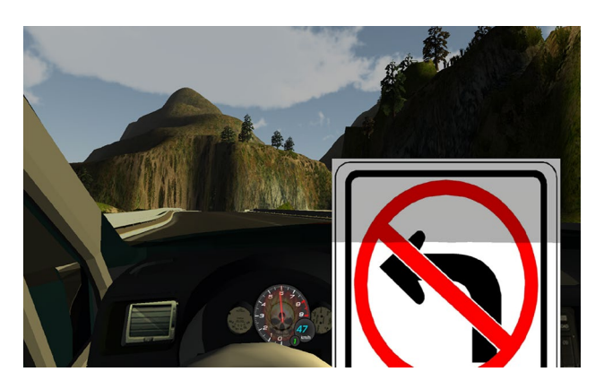
Figure 3. Screenshot of the warning signal given to participants just before one of the forks.

as a backward accelerator (e.g., when backing up). The maximum speed of the vehicle was limited to 140 km/h, which encompasses most world-wide motorway speed limits<sup>75</sup> except for the German autobahn and the motorways in the UAE. Car engine and navigation sounds were presented through the VR headset's earphones to further increase immersion in the driving environment.