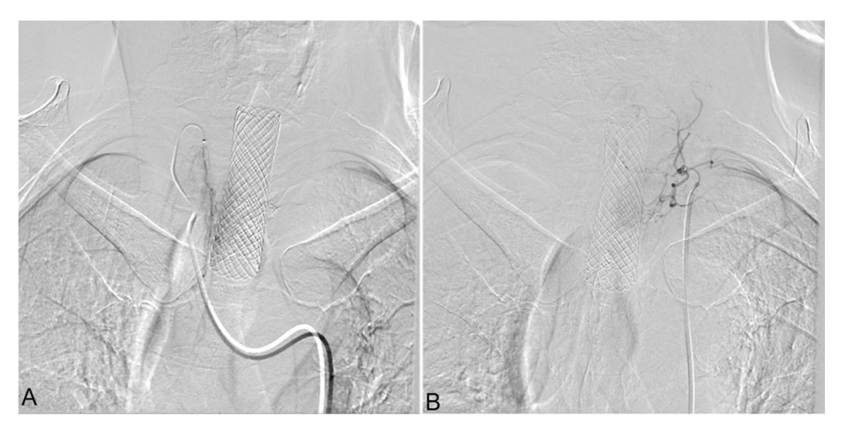
Figure 2. DSA showed the following findings: The right inferior thyroid artery was involved in the blood supply to the tumor, sending out many abnormal collateral vessels, and abnormally stained lesions could be seen ( A ). The left inferior thyroid artery was involved in the blood supply to the tumor and sent out many abnormal collateral vessels ( B ).

were supine on the digital subtraction angiography table. Patients were awake, and local anesthesia was applied at the right femoral artery puncture point. Femoral artery puncture was performed using a 5F arterial sheath. A 5F artery sheath was inserted into the right femoral artery by the right femoral artery puncture. A 5F Cobra catheter or vertebral artery catheter was introduced through the sheath to find the supporting artery corresponding to the lesion.