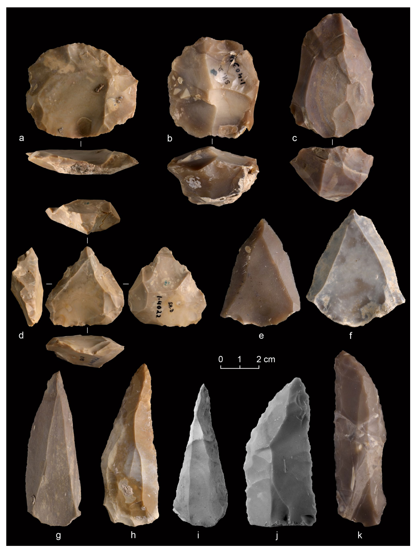
Figure 2. Middle Palaeolithic lithic artefacts from Shukbah Layer D: ( a ) preferential centripetally prepared Levallois core; ( b ) recurrent centripetal Levallois core; ( c ) bidirectional Levallois core; ( d ) exhausted preferential centripetally prepared Levallois core; ( e – g ) Levallois points; ( h – i ) Hummal points; ( j – k ) convergent scrapers on blades.