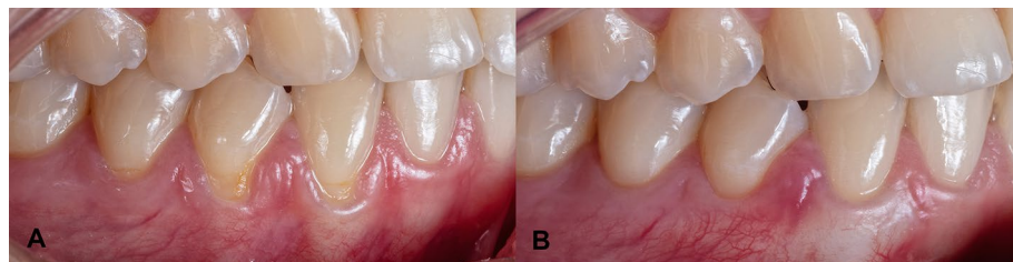
Figure 2. (A) Baseline, (B) 6 months results.