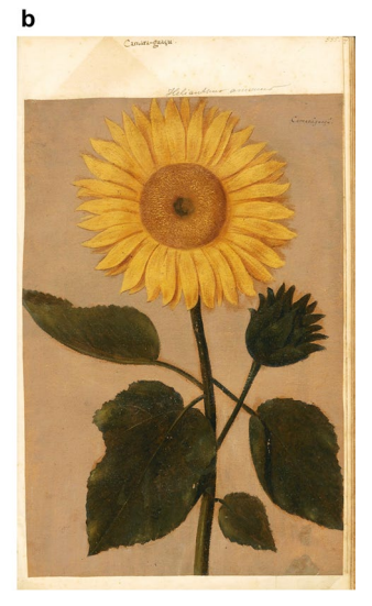
Figure 3. (a) The African spice-producing tree Xylopia aethiopica depicted in the Theatrum Rerum Naturalium (p. 321); (b) The first record of the sunflower ( Helianthus annuus ) in Brazil ( Theatrum : 555).

clear information whether X. aethiopica is cultivated in the Neotropics or imported; thus, the origin of the fruits, seeds or its powder in Brazil remains uncertain.