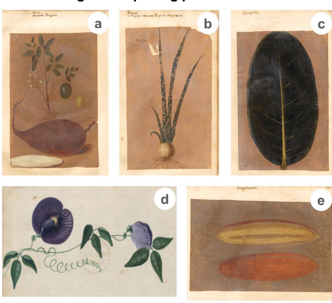
Figure 6. (a) Spondias tuberosa with the tuber painted in front of the branch with leaves, tiny white flowers and a detail of the immature (green) and mature (yellow) fruit in the back ( Theatrum Rerum Naturalium : 261); (b) Infertile individual of Hippeastrum psittacinum ( Theatrum : 389); c Ficus gomelleira leaf, probably picked from the ground ( Theatrum : 157); (d) Flowering vine of Centrosema brasilianum ( Libri Principis : 1); (e) Amphilophium crucigerum dry open fruit without seeds ( Theatrum : 387).

occasions also showing their tubers, such as Spondias tuberosa Arruda, known as Umbi [Iva Umbu], of which the prominent tuber in the bottom front captures the attention of the observer (Fig. 6a). Likely associated to a scientific purpose, drawing some plant parts out of proportion corresponds to a pictorial style also observed in other iconographies. This is also the case in the Icones Plantarum Malabaricarum , which depicts plants from Ceylon (modern Sri Lanka) in the eighteenth century and often accentuates useful fruits, flowers or roots<sup>75</sup>.