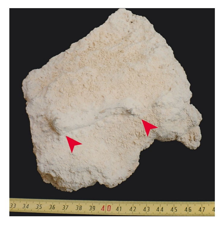
Figure 4. Holotype of Geochelone atlantica López-Jurado, Mateo and García-Márquez, 1998 (DBULPGC 17) in original matrix before preparation. Arrowheads point to femoral epiphyses.

belonging to the Chevalier material. Red-footed tortoises were popular pets in Europe during the twentieth century<sup>19</sup>, and somebody living in the French community running the local salt business could have brought the tortoise to the island. However, for the formation of the tufa-like matrix originally covering the type specimens, a humid environment would have been required over several years<sup>20</sup>—quite the opposite of the conditions on the arid Sal Island. Another possibility is therefore that the putative fossils were fabricated and that their matrix has been faked.