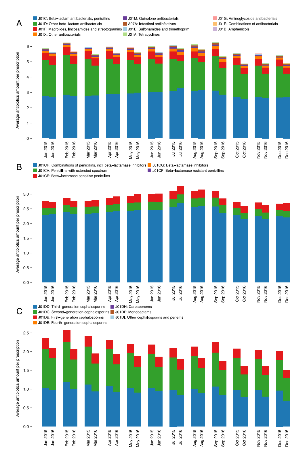
Figure 2. Monthly average antibiotics amounts per prescription for Turkey among the diagnosis of "acute upper respiratory infections" in 2015 and 2016. (A) Breakdown with respect to third level ATC codes, (B) Breakdown with respect to "beta-lactam antibacterials, penicillins" (i.e., ATC code J01C), and (C) Breakdown with respect to "other beta-lactam antibacterials" (i.e., ATC code J01D).