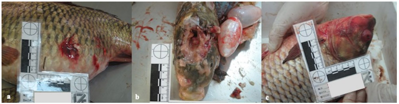
Figure 1. Main gross lesions. (a) Multifocal moderate cutaneous hemorrhages, skin of the ventro-lateral part of the body, common carp. (b) Diffuse mild to moderate meningeal hyperemia, brain, common carp. (c) Focally extensive moderate cutaneous hemorrhages and diffuse hyperemia with severe exophthalmos, European crucian carp.

with electric cables immersed in water. Electric fields caused by these rudimentary devices are uncontrolled and can affect in its range of action all fishes of all size and age classes, up to species, which do not constitute a commercial interest. During inspections performed by the Authorities, electrofishing equipment is not usually found and so cannot be related to the caught fishes, since it is often thrown away into the water or hidden 6 . Further tools are needed to support in the Court the hypothesis of electrofishing in similar illegal cases. In order to develop a specific forensic approach, animals found in suspected poaching episodes in Northern Italy (Po River) between 2014 and 2018 were retrospectively investigated in this study and compared with a certainly assessed poaching episode occurred in June 2018. Pathological analyses carried out on these field cases were aimed to assess post-mortem evidences related to the exposure to electro-device usage in fish.