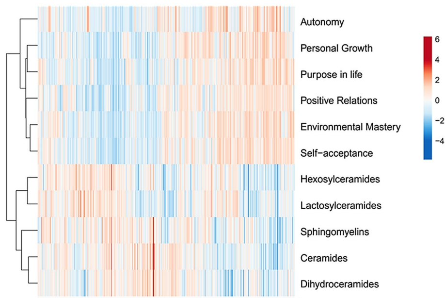
Figure 2. Hierarchical clustering heatmap of subjects from MIDUS, based on PWB dimensions and sphingolipid levels. Columns represent individual participants. Rows represent sphingolipid classes and PWB dimensions. A three-color scale was used with blue indicating low relative values, white indicating average values, and red representing high relative values. This heatmap was performed using the web tool ClustVis 2.0 ( https://biit.cs.ut.ee/clustvis ).