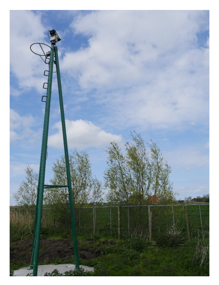
Figure 3. The laser placed on a steel, three-legged tower (the top was 6 m above ground level) that was secured to a concrete slab (1.5 \text{ m} \times 1.5 \text{ m}) weighing approximately 2000 kg.