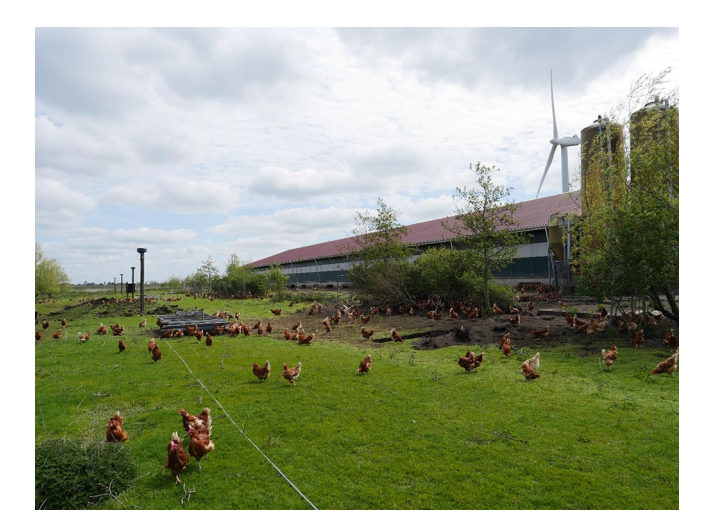
Figure 2. Wide-angle video-cameras installed at a height of approximately 4 m above ground-level on poles in the free-range study area.

Video-camera recording system (VCRS). The free-range study area was surveilled using eight Hikvision low-light Turret 4Mp video-cameras, each fitted with a fixed focus wide-angle 2.8 mm lens (Hikvision, Hangzhou, China; www.hikvision.com). The cameras were positioned on poles at a height of 4 m above ground-level (Fig. 2). It was not possible to position cameras in the grass pastures that lay adjacent to the free-range study area, and which extended hundreds of meters away from the barn. Thus, the impact of laser on wild birds in the grass pastures is assessed anecdotally, i.e., is based solely on observations made daily by the farmer.