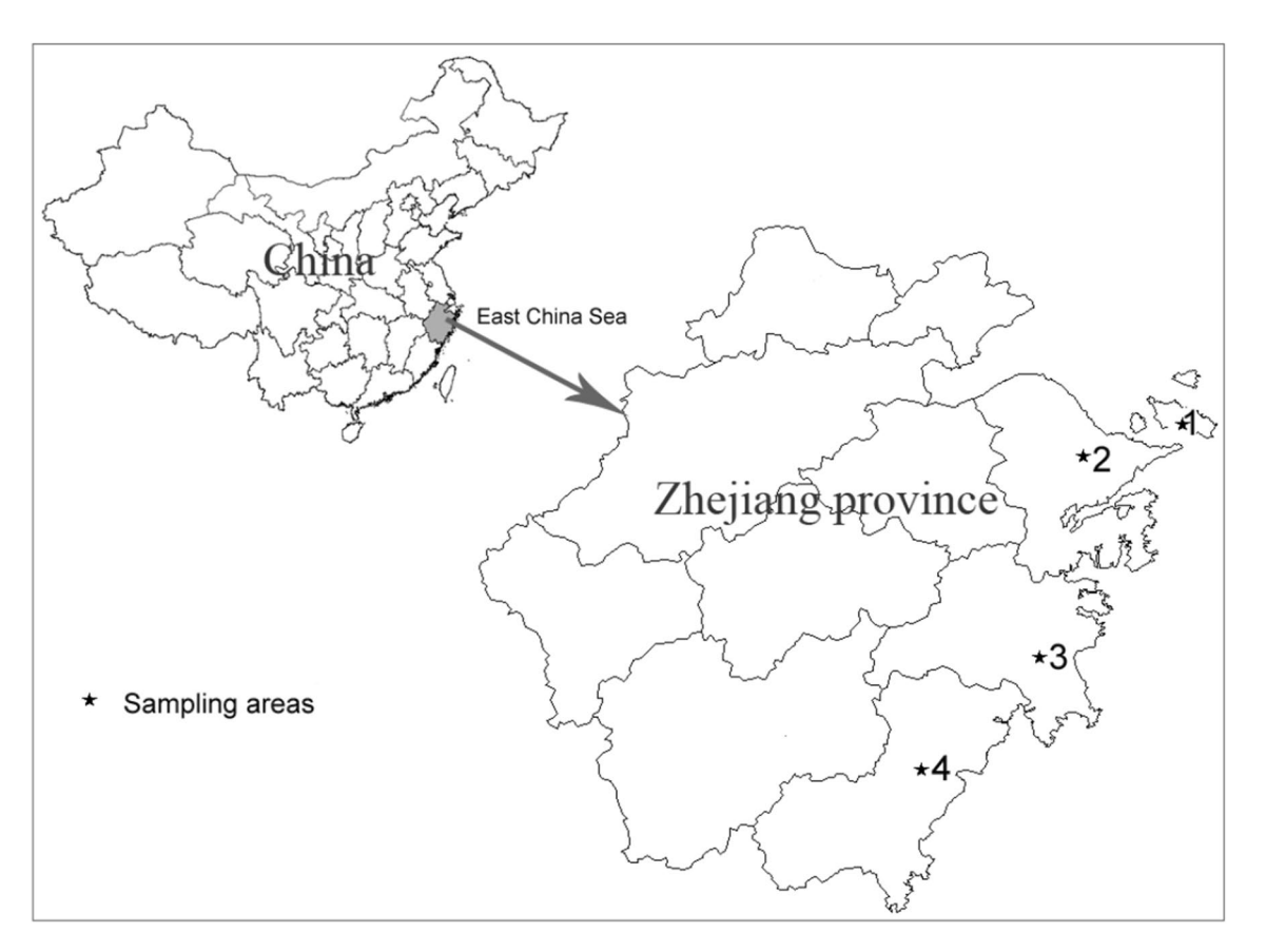
Figure 1. Simple map of the sampling areas of Zhejiang province, China.