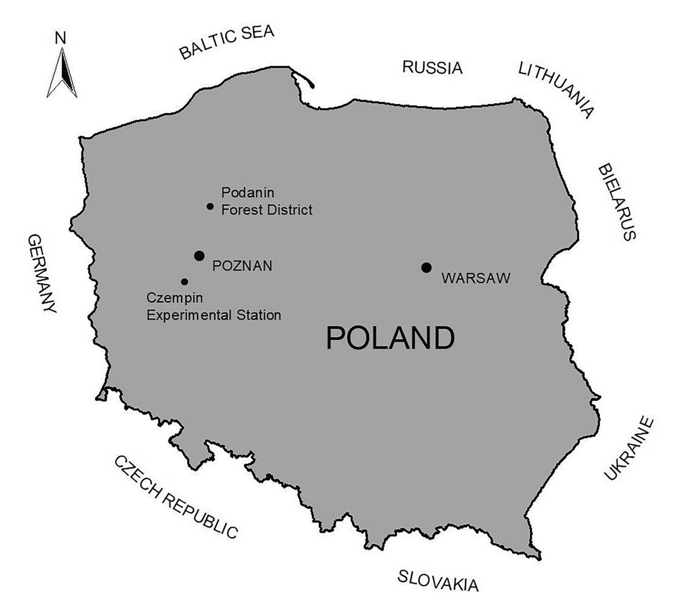
Figure 3. Study area at the background of Poland borders, with study site where forest (Podanin Forest District) and field (Czempiń Experimental Station) ecotypes were harvested.