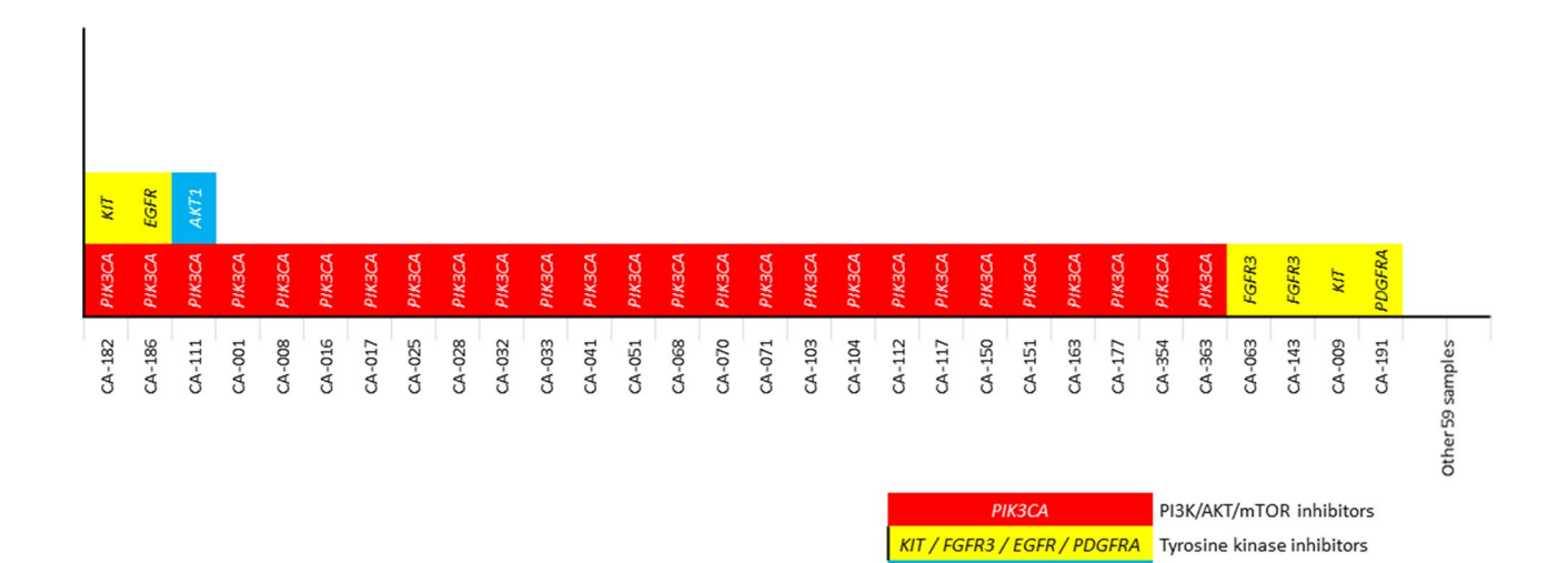
Figure 3. An overview of actionable genetic mutations in cervical cancers. CA-xx represents identification numbers for pathologic specimens of each patient.

Table 5. Association between recurrence and frequency of genetic alterations or HPV status. HPV humanpapillomavirus. *Fisher's exact t-test.