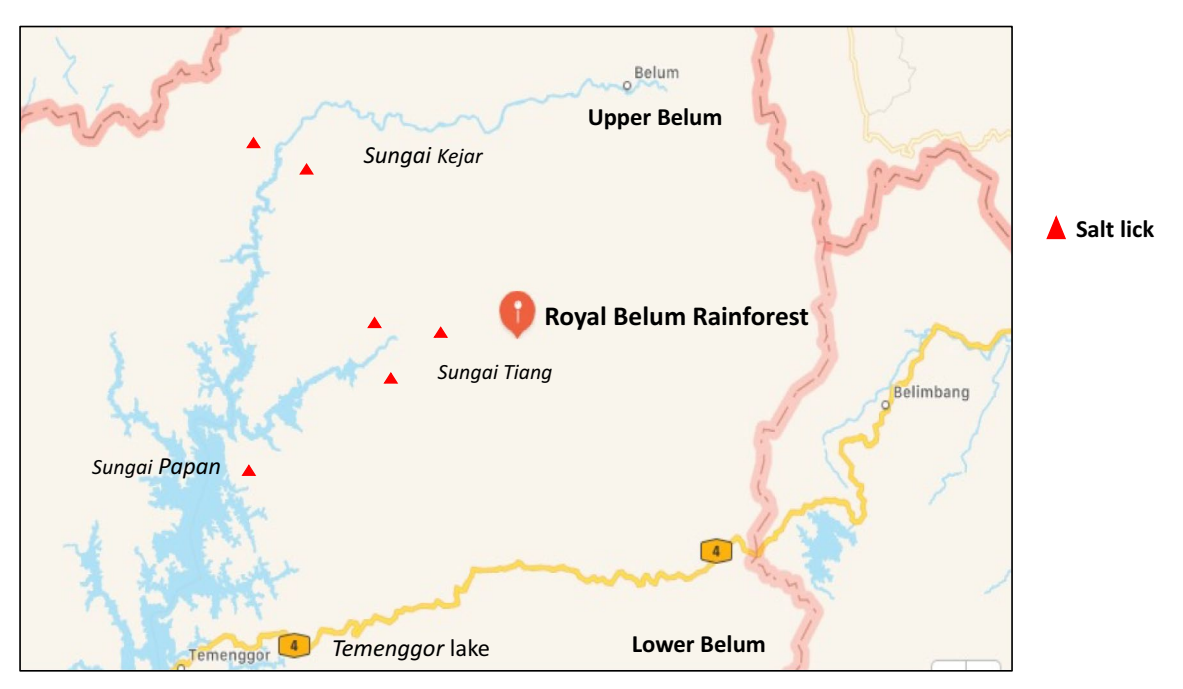
https://www.gps-coordinates.net/; Latitude: 5°42'37"N; Longitude: 101°31'56"E

Figure 3. The distribution of salt licks at the Royal Belum Rainforest. Map details: Royal Belum Rainforest: Generated from GPS Coordinate (https://www.gps-coordinates.net/); Latitude: 5°42'37"N; Longitude: 101°31'56"E.