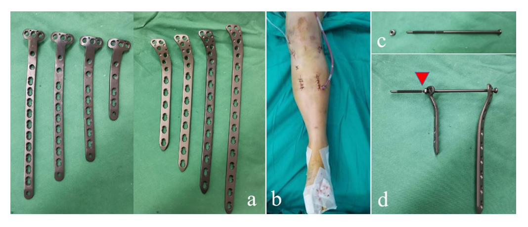
Figure 3. (a) Two pre-contoured locking compression plates specially designed for proximal tibia. (b) surgical incisions. (c) Slot-designed compression bolt. (d) The components of dual plating combined with compression bolt were presented. (Red arrow, slot-designed area. Left, medial locking plate. Right, lateral locking plate).

prophylaxis. For the patients in group 1, dual plate fixation was performed through separate anterolateral and medial skin incisions of the proximal tibia in the supine position, and a universal external fixator or retractor was used for intraoperative reduction. During reduction, the lower limb alignment was corrected, and the width and depression of the tibial plateau were restored. Intraoperative fluoroscopy was used to examine the reduction status. Two pre-contoured locking compression plates (WEGO, Wei Hai city, PR China) specially designed for the proximal tibia were applied to the anterolateral and medial tibia (Fig. 3a). Then, lock screws of suitable length were inserted into the corresponding channels. Intraoperative C-arm fluoroscopy was performed again to confirm the reduction. Layered wound closure and drain insertion were performed after rinsing with normal saline (Fig. 3b).