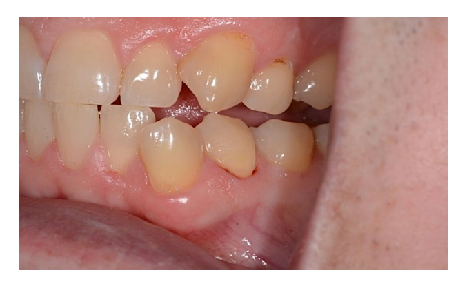
Figure 1. Patient with exposed cervical dentin surfaces and signs of erosion.

Gluma consists of glutardialdehyde-hydroxyethyl-methacrylate and prevents hypersensitivity by reducing dentinal permeability and clotting the proteins and amino acids in the peripheral dentinal tubules<sup>11</sup>. This inhibits the flow of fluid through the tubules, which is the cause of the sensitivity. Patients can also experience sensitivity after invasive restorative work. Gluma desensitizer (Heraeus Kulzer, Armonk, NY, USA) can be used after tooth preparation for receiving indirect restorations and below every restoration to relieve sensitivity and ensure comfort. Gluma restores collapsed collagenous fibers, thereby improving the bond strength of many adhesives.