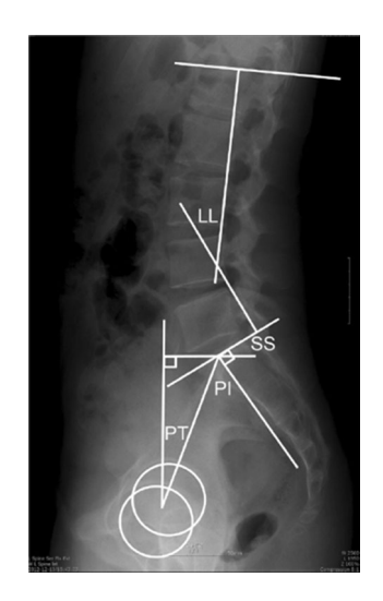
Figure 3. Schema of the measuring methods for each spino-pelvic parameter on a standing radiograph of the whole spine and pelvis. LL, lumbar lordosis; SS, sacral slope; PI, pelvic incidence; PT, pelvic tilt.

Figure 2. Schema of the definition of a PGD-positive case. The overhang is measured by drawing a circle around the femoral head on the anteroposterior view. Even a small overhang of the femoral head (R > r) is considered a PGD-positive case. PGD, pistol grip deformity.