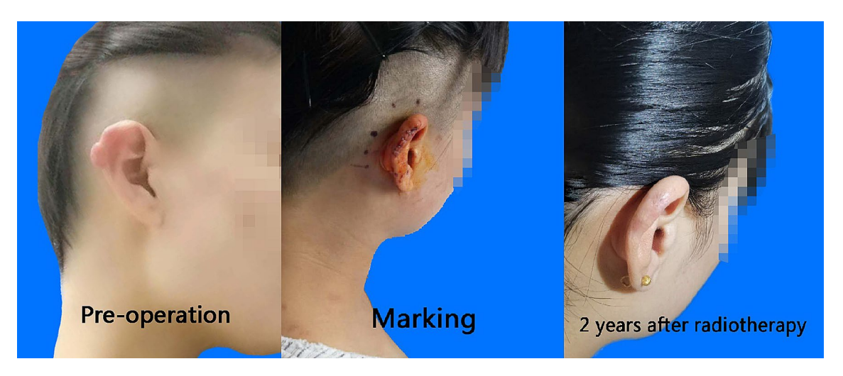
Figure 3. A typical ear keloid.