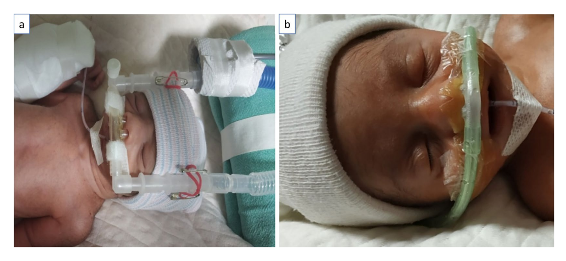
Figure 1. Representative clinical images of Hudson prongs ( a ) and Ram cannula ( b ) as nasal interface for delivering nasal continuous positive airway pressure.

to a traditional nasal cannula used to deliver oxygen, but its stiffer design allows a higher flow rate and pressure delivery. As it is made of a soft material, there is lower airflow resistance and a tendency for reduced nasal trauma.