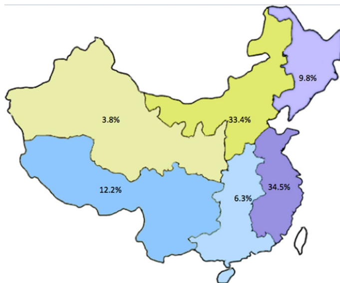
Figure 1. The source of clinical information from different areas in China.