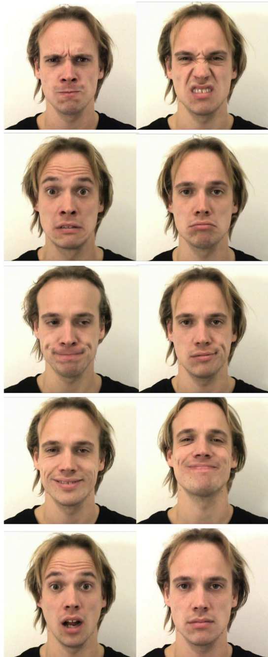
Figure 1. Example facial expressions for each of the nine emotion categories (from the top left corner per row: anger, disgust, fear, sadness, embarrassment, contempt, happiness, pride, surprise) and a neutral blank stare (last image bottom right corner) included in the study. The still images are the last frames of the high expression intensity video for each emotion category of the selected encoder.

in response to the emotional expression of embarrassment partially matched the characteristic embarrassment expression of mouth corners pulling outward (i.e. increased activity in the zygomaticus site) but not lips pressed (i.e. no significant change in activity in the levator site). The facial muscle activation pattern in response to the emotional expression of pride matched the characteristic pride facial expression of mouth corners pulled outward and upward, as the activity in the zygomaticus site and in the levator increased significantly.