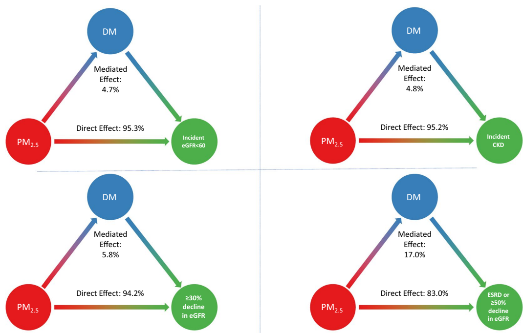
Figure 2. Proportion of the association between PM_{2.5} and kidney disease outcomes mediated by diabetes.