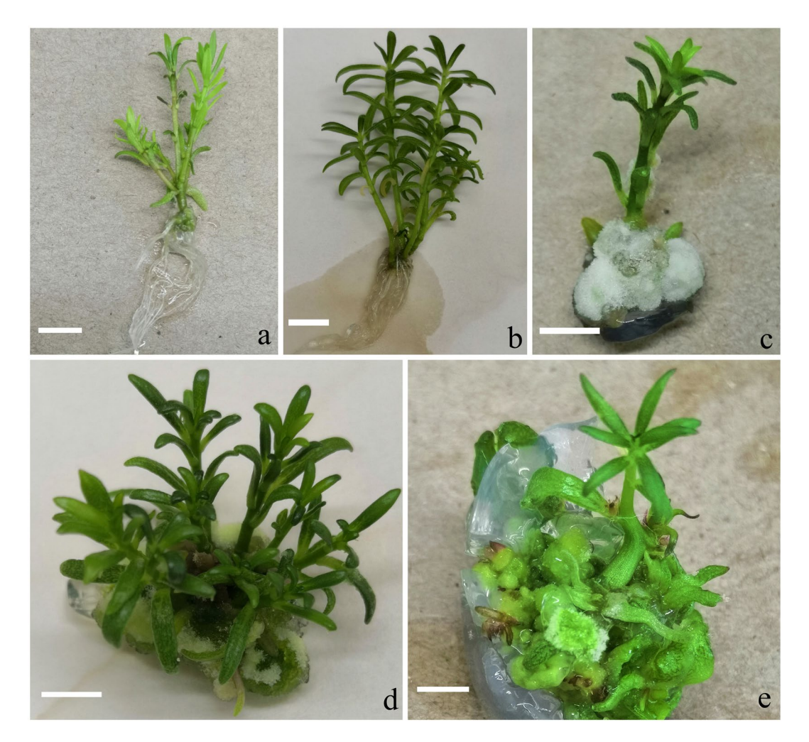
Figure 1. Axillary shoot proliferation of Portulaca pilosa on different MS media. ( a ) Axillary shoots proliferated on PGR-free medium; ( b ) axillary shoots proliferated on medium with 1.0 \mu M KIN; ( c ) only one shoot and callus formed on medium with 1.0 \mu M 2,4-D; ( d ) multiple shoots proliferated on medium with 1.0 \mu M BA, showing some callus at the base; ( e ) shoots developed on medium with 1.0 \mu M TDZ, showing callus and hyperhydric leaves. Bars = 1.0 cm.