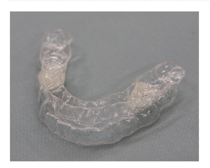
Figure 2. Mandibular advancement appliance. The maxillary and mandibular dental casts were made after the alginate impressions were obtained. The dental arches of both jaws were fabricated by placing a 1-mm thermoforming polyethylene plate on the dental cast using a full pressure dental thermoforming machine. The maxillary and mandibular components were joined by autopolymer resin with the maximum mandibular protrusion tolerated without discomfort or pain.

used to determine the duration, defined as the time between the first negative deflection and the return to the pre-swallowing level in the trajectory<sup>8</sup>. Peak amplitude was determined as the maximum absolute value of the amplitude of SH EMG (Fig. 3). To normalise the peak amplitude, the value in the neutral position was determined