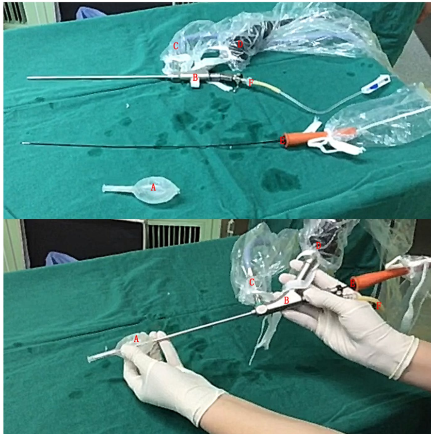
Figure 1. The instruments used for the “Su-Wang technique”. (A) The self-made working sheath. Its tail can insert into the vaginal cavity through the incision made at the scrotum, and can be steadily fixed to the parietal layer of the tunica vaginalis. Please also refer to Fig. 2b. Its cavity can be inserted by B. (B) AUTOKLAV (KARL STORZ, Germany) was used for scrotoscopy because no specialized devices were available. The device comprises a percutaneous mini-nephrolithotomy instrument set designed for the endoscopic treatment of kidney stones. It contains an endoscope and a working irrigation channel. (C) Connected to light source. (D) Connected to display screen. (E) Plasma cylindrical electrode (PCE). (F) Connected to the irrigation solution (normal saline).