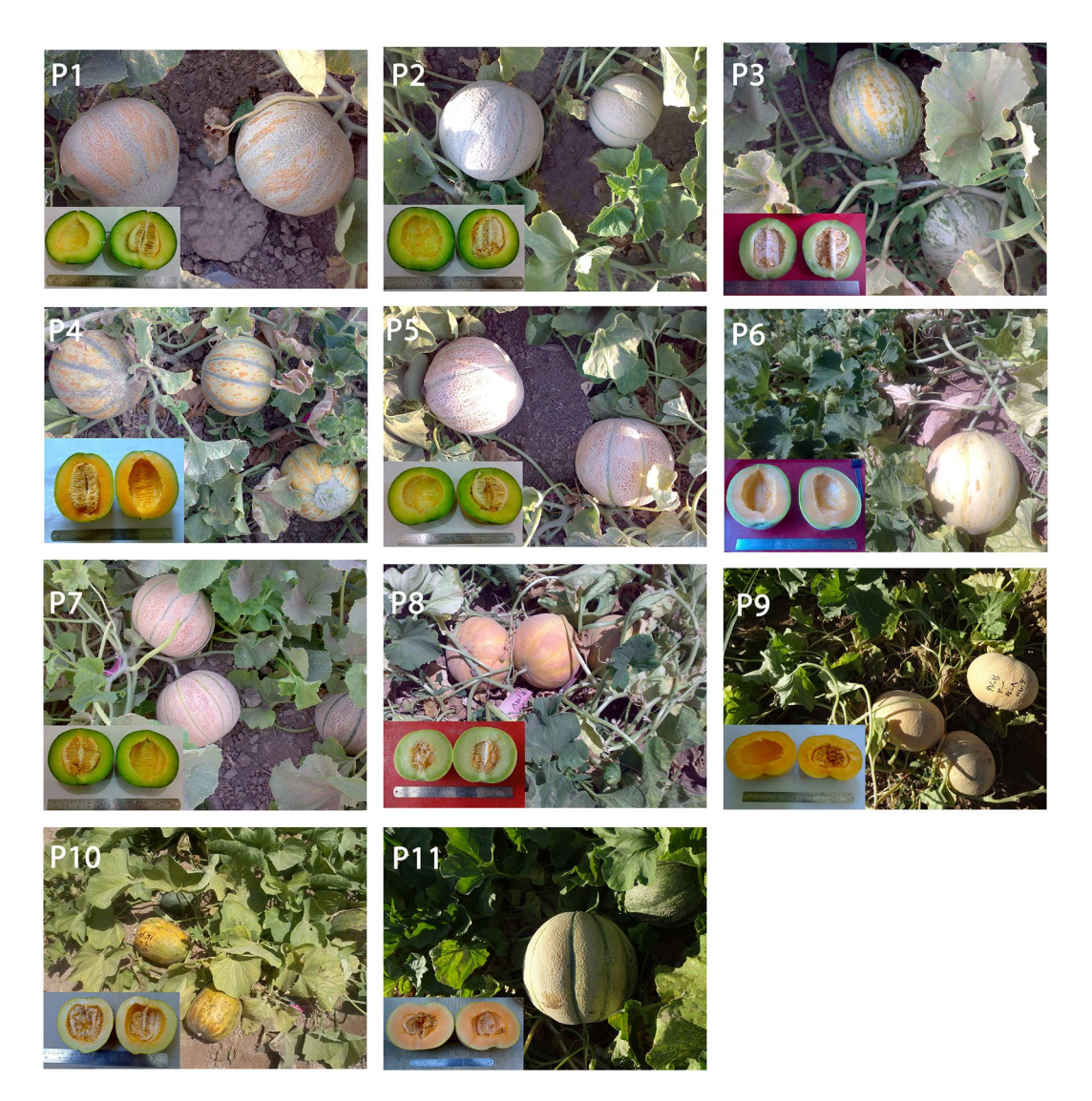
Figure 1. Showing genetic variations especially in fruit characteristics of melon parents used in diallel analysis. (P1–P11; correspond to the parent codes listed in Table 1).

The parents (11 genotypes) and their 55 F_1 hybrids along with six local cultivars used as checks were evaluated using a simple rectangular lattice design (8 × 9) with two replications for each of the experimental conditions (saline and non-saline). Each plot consisted of three rows, 6 m long, 3 m spaces between the rows, and 0.5 m spacing between plants within each row. The seeds of the genotypes were planted directly on top of the furrows. Irrigation was applied by furrow irrigation using a schedule commonly used for melon production in the region. In the saline experiment, freshwater was applied until three weeks post-emergence but later shifted to saline water ( EC_w = 14 \text{ dS m}^{-1} ). Identical irrigation volumes, monitored by flow meters, (each irrigation volume equal to 260 m<sup>3</sup>.ha<sup>-1</sup>) were applied to the experimental (both saline and non-saline) plots. The saline treatment irrigated seven times with dissolved sodium chloride (1 M NaCl) flowed from a NaCl supply tank (4000 L) into the irrigation water to maintain the desired level of EC_w (14 dS m<sup>-1</sup>) using calibrated flow meters<sup>32</sup>. The EC_e was measured in all plots from the 0 to 40 centimeter soil depth at planting and harvesting stages. Using one soil sample from each plot at harvest, average values of EC_e for the non-saline and saline field conditions were measured to be of 1.5 and 8.65 dS m<sup>-1</sup>, respectively.