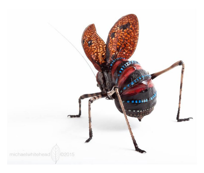
Figure 1. Photograph of an adult female mountain katydid performing her display.

of their display could decrease as a function of predator experience, if predators learn to suppress their aversive response<sup>27</sup>. Alternatively, this effect may be ameliorated by the presence of further co-occurring defences, such as an aposematic element combined with a deimatic element.