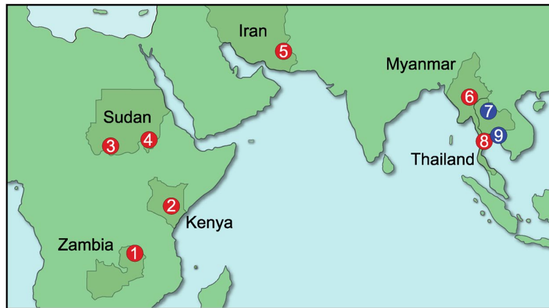
Figure 1. Geographic locations of blood sampling sites. Goat malaria parasites in (1) Zambian samples were collected in 2010, as published 12 . Sampling sites in the present study are in (2) Kiambu and Kitui counties, Kenya (in 2016 and 2017, respectively); (3) West Kordufan state and (4) Blue Nile state, Sudan (2014); (5) Sistan and Baluchestan province, Iran (2016 and 2017); (6) Nay Pyi Taw, Myanmar (2016); and (7) Nan, (8) Phetchaburi, and (9) Chonburi and Rayong provinces, Thailand (2016 and 2017). Sites where Plasmodium sequences were detected are shown in red and sites where Plasmodium was not detected are shown in blue. The map was made using Adobe Illustrator CC 2017 (Adobe Systems Inc. San José, CA).