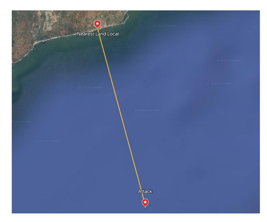
Fig. 3 Example of the procedure used to obtain the distance from the coast to a piracy event. All of the distances were acquired using an identical procedure.