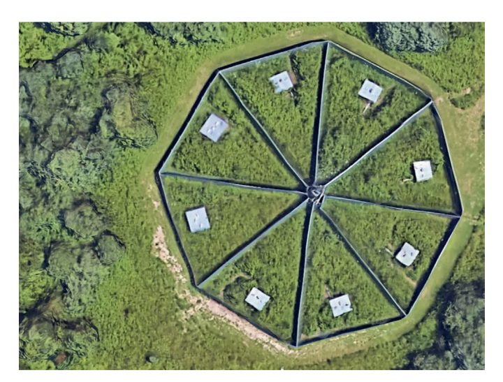
Fig. 2 | View of our mouse enclosures for rewilding. In total, the eight wedge-shaped pens cover nearly 1,500 m<sup>2</sup>. Each contains a hut and vegetation. We have used the system for our rewilding experiments in immunology since 2014.

Instead, rewilding and organismal performance arenas require more robust statistical tools to dissect complexity. For example, generalized linear mixed statistical models lend insight by quantifying the immunological variance independently or interactively associated with genotype and multiple environmental variables as well as sex, age and individual identity. Such statistical approaches are routinely used in wild immunology (for example, to reveal differential survival among Soay sheep exhibiting autoantibodies<sup>68</sup> or immunosenescence<sup>69</sup>). When such statistics are combined with experimental designs that control for genotype, and even for aspects of environment, the power of the approach to dissect causes of immunophenotypic divergence is enhanced. For example, in our rewilding work, we can match the temperature, humidity and lightdark cycles in the lab to what mice are experiencing in the field, to control for abiotic factors that are not of central interest to our work. We can therefore exclude thermogenesis and account for initial body mass (using generalized linear mixed models) as causes of the altered T cell populations in the lamina propria of mice outdoors<sup>59</sup>.